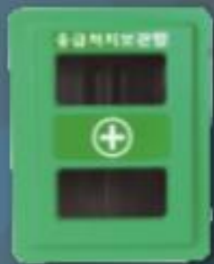
First Aid Kit Cabinet SKS-2-2

Application: Cabinet for First Aid Kit Remark: All-Weather Cabinet Dimension: 260 x 520 x 187(W x H x D)