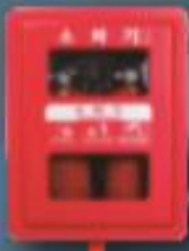
Two Fire Extinguisher Case + Anchor Type pole SKS-2-500