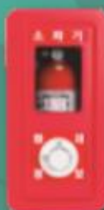
Fire Extinguisher Case + Fire Alarm SKS-1-1

Application: 3.3kg Fire Extinguisher Usage: Indoor & Outdoor use(Show room, Work Place, Ship, Home & Office) Dimension: 260 x 520 x 187(W x H x D)