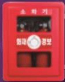
Two Fire Extinguishers Case SKS-2-1