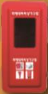
Fire Escape Facility Case SKS-1-5