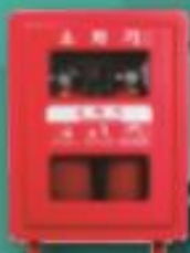
Two Fire Extinguisher Case + Stand alone pole SKS-2-7