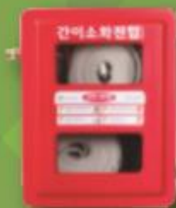
Mini Fire Hose Stations SKS-2-3

Application: Temporary Fire Protection facility Components : Fire Hose 25A 15m, 25A Gwanchang & 25A Angle Valve 25A Dimension: 260 x 520 x 187(W x H x D)