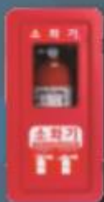
Fire Extinguisher Case SKS-1