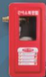
Mini Fire Hose Station SKS-1-3