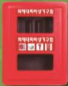
Fire Escape Facility Case SKS-2-5

Application: facility case for Fire Escape Remark: Double case Water Proof Dimension: 260 x 520 x 187(W x H x D)