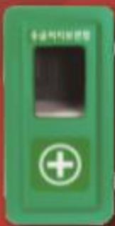
First Aid Kit Cabinet SKS-1-2

Application: facility case for Fire Escape Remark: Double case Water Proof Dimension: 440 x 560 x 220(W x H x D)