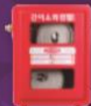
Mini Fire Hose Stations SKS-2-3-7

Application: Temporary Fire Protection facility Components : Fire Hose 25A 15m, 25A Gwanchang & 25A Angle Valve Dimension: 260 x 520 x 187(W x H x D)