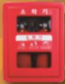
Two Fire Extinguishers Case SKS-2